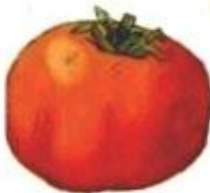
TOMATO [tə ˈmɑːtəʊ]