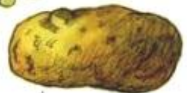
POTATO [pə ˈteɪtəʊ] КАРТОФЕЛЬ