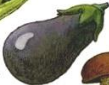
EGGPLANT / AUBERGINE [ˈeɪplɑːnt / ˌaʊbeɪdʒiːn]